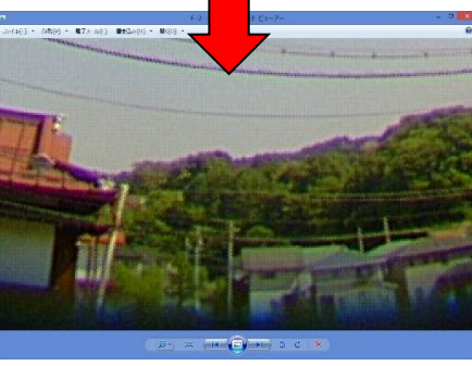
Even with our FRIP lens, the image at the fringe area is not sufficiently clear.