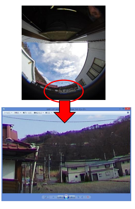
Very clear at 100m in all 360° directions.