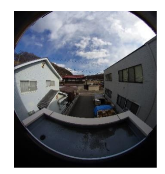
【OPT Ultra high resolution lens】 12M pixel